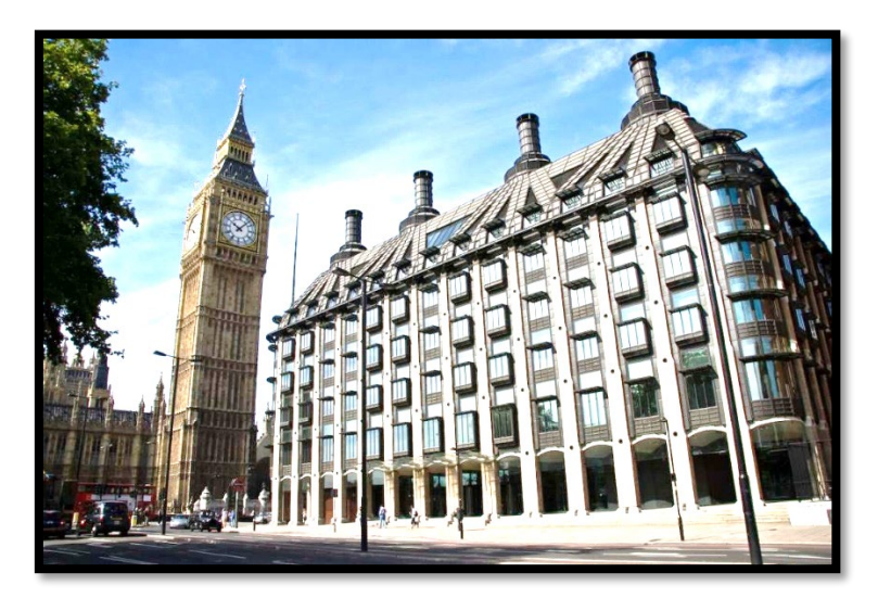
Figure 1: House of Westminster, Portcullis House, London

2023 saw the launch of UNISON's ' Year of Black Workers ' campaign with Maragaret Greer, UNISON National Officer for Race Equality, putting out a call for ten Black Members Officers to attend a parliamentary round table discussions at the House of Westminster hosted by Bell Ribeiro-Addy (Labour MP for Streatham) and with several other MP's in attendance from the party, who all sympathise and want to progress UNISON's campaign around the Ethnicity Pay Gap (EPG), Cost-of-Living, Windrush Generation, UN immigration and the hostile environment to ensure UNISON's Black member objectives are being taken forward for consideration, as such, I jumped at the opportunity to get invovled.