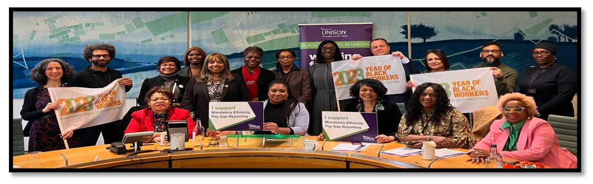
Figure 4: UNISON SE Black Members Officers with Labour MPs